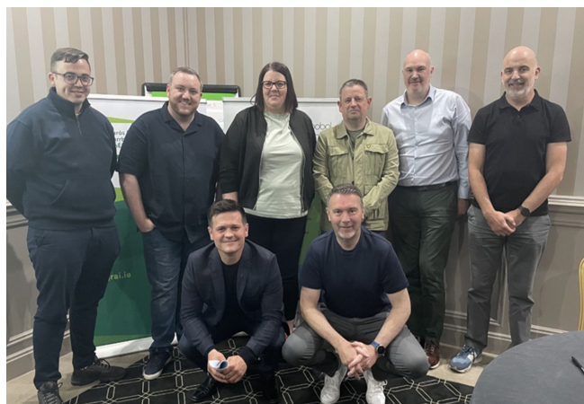
Participants at our Social Impact Fund focus group in Dublin.

We expect that the Social Impact Fund will become operational later in 2026 and we thank all those who participated in our Call for Input to date.