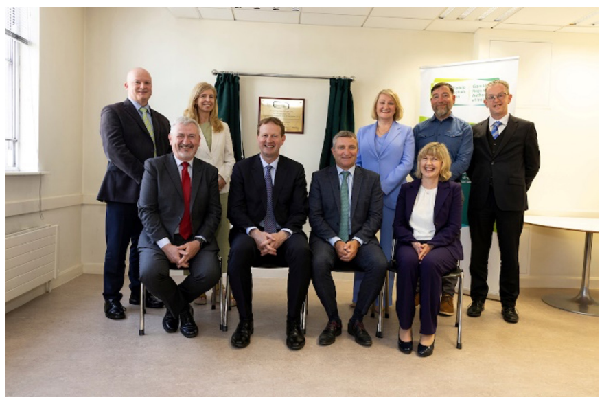
The GRAI welcomes Minister Jim O'Callaghan and Minister of State Niall Collins to its new offices.